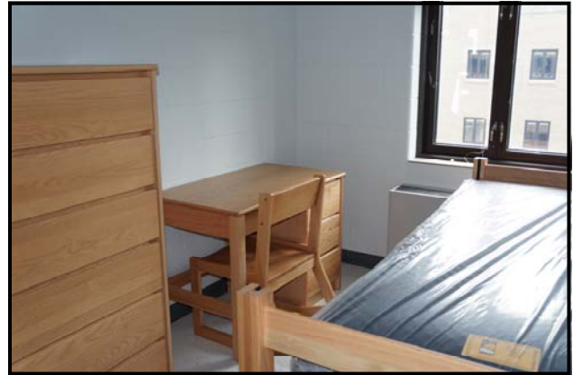
Three and Four Bedroom Layouts

Single rooms are one student in one bedroom. There is a Resident Assistant (RA) on each floor that is responsible for community development and mentoring the residents. The RA staff report to the Hall Director, a master-level professional staff member assigned to live and work with the students of their building.